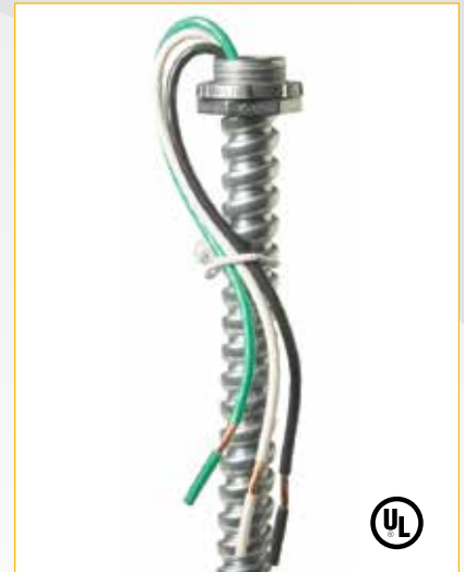
STANDARD HEALTH CARE FIXTURE WHIP Shown with Standard Screw-In Lock Nut Connector