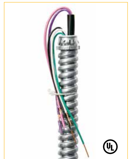
ILLUMINATION CONTROL HEALTH CARE FIXTURE WHIP Shown with Standard Screw-In Lock Nut Connector